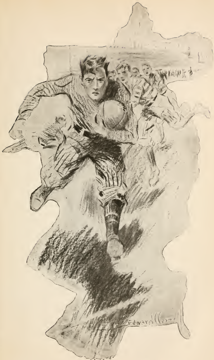
Straight across the last white line to victory